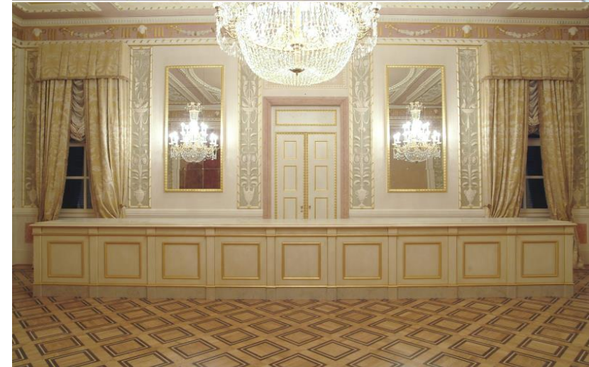
Teatro La Fenice - Sala Dante